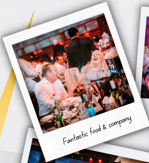
Fantastic food & company