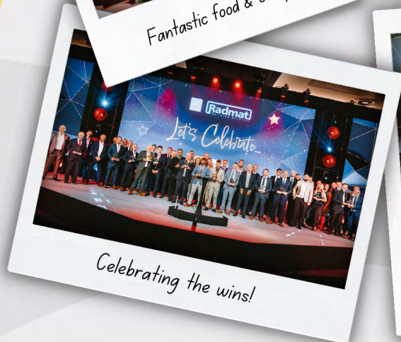
Celebrating the wins!