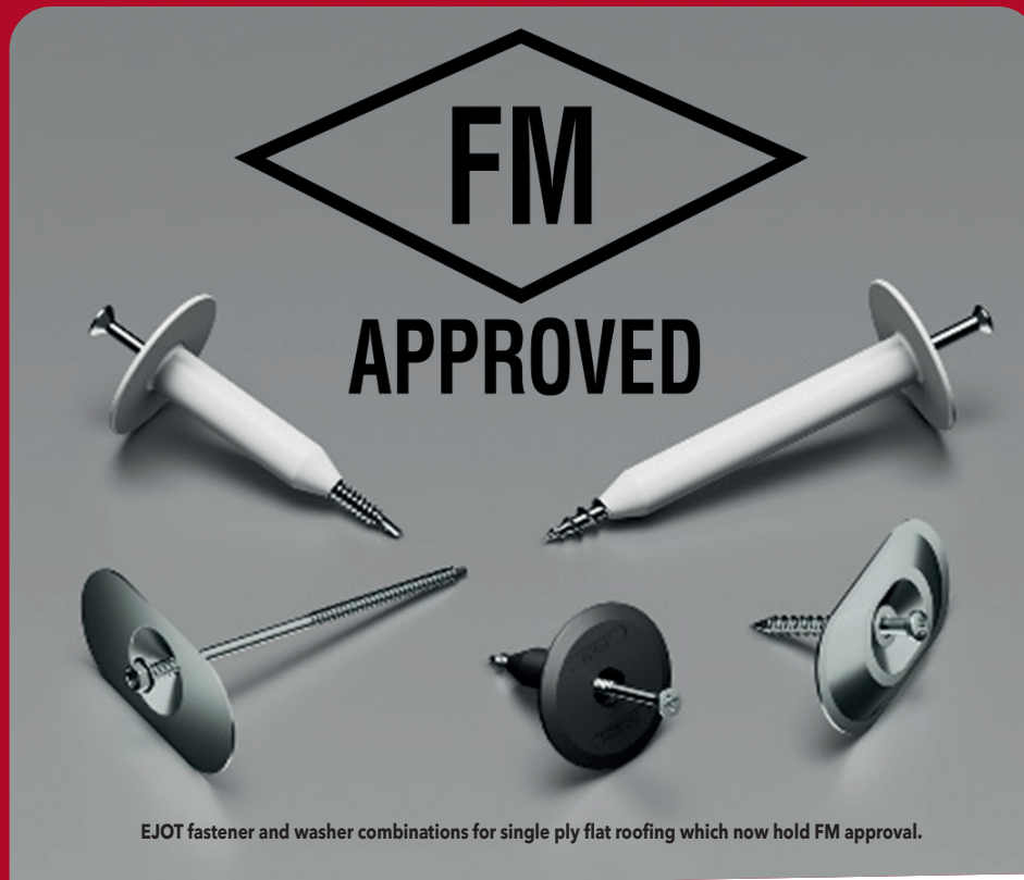
EJOT fastener and washer combinations for single ply flat roofing which now hold FM approval.

Contact technical support by emailing EJOT UK via info@ejot.co.uk or call 01977 687040.